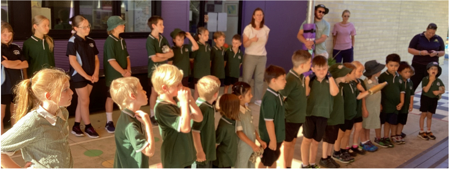
Getting to Know each Other with Me as a Learner