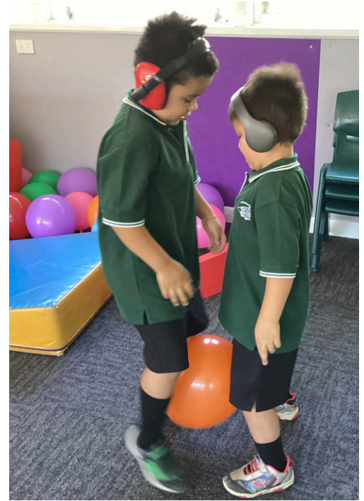
Learning to work together